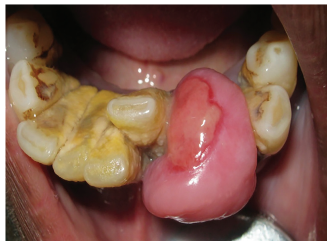
Fig. 1: Intraoral picture of the lesion

A solitary pedunculated well-defined exophytic lesion was present on the interdental gingiva in the region of 32 and 33. It was oval in shape measuring 2 cm in its greatest dimension, pale in color. There was erosion present with a coating of slough as a secondary change on its superior surface.