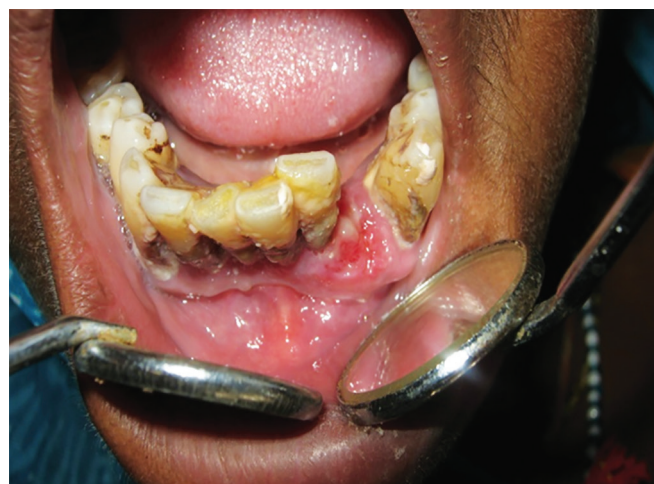
Fig. 3: Postoperative picture

On palpation, it was slightly tender on the superior aspect where there was erosion while in rest of the areas it was nontender. It was firm in consistency, mobile, non-compressible, nonreducible, and nonpulsatile. Moreover, 31 and 32 were mesially drifted while 41 was distally drifted due to the growth. A provisional diagnosis of fibroma was given. The differential diagnosis included peripheral giant cell granuloma (PGCG), irritational fibroma, pyogenic granuloma, POF, and metastatic cancer.